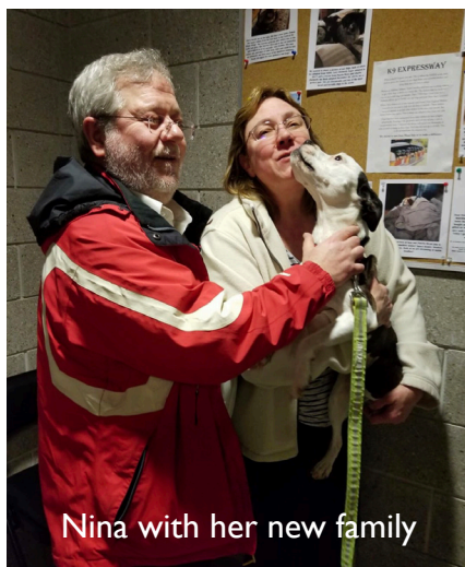
Nina with her new family

In addition to Kane, the New Hampshire Humane Society also accepted the wonderful dogs Nina and Scrappy.